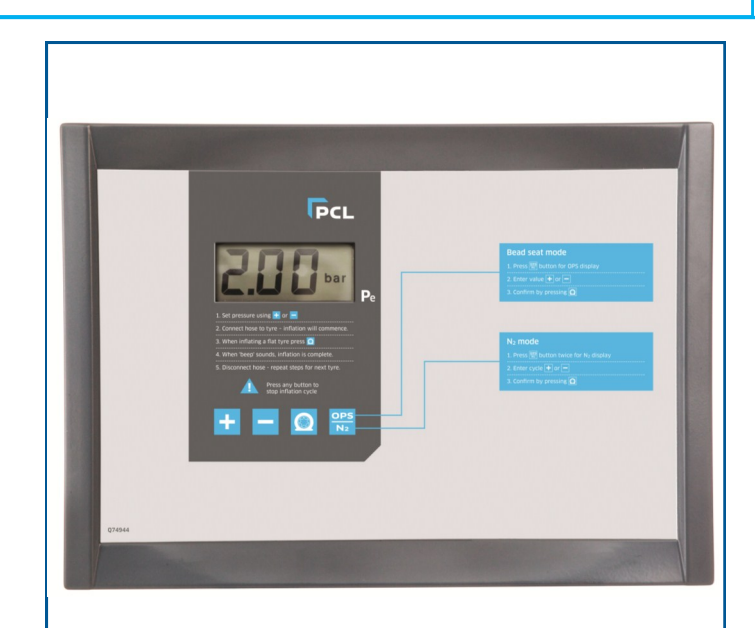
Image shown is PCL standard decal. Actual decal may vary by individual part number.

Any employer allowing the use of this product in their field of work must distribute this instruction manual to all users. The employer must also ensure all users read, understand and follow the instructions as described in the manual, safety warnings, labels, etc.